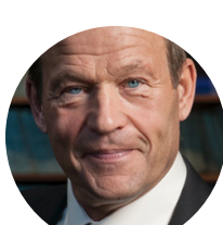
ROBERT SWAN, OBE, FRGS

Principal Researcher Microsoft Research Author Radical Markets